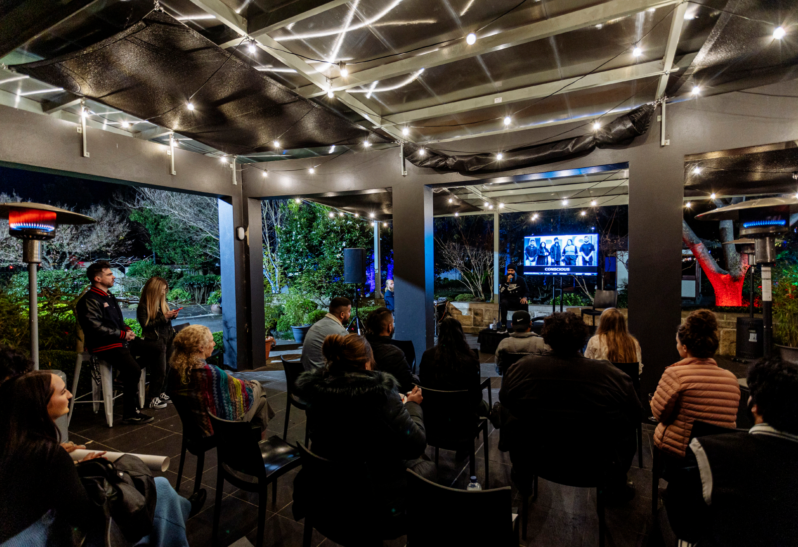
2021/2022 Conscious Cohort in Conversation with LFRESH The LION at Sundown Sessions