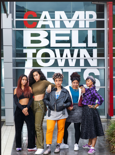
Conscious Cohort 2019

Our vision is to keep building the Conscious family of artists and creatives with our collaborators in the local region and beyond to share resources, exchange knowledge and support local artists to realise their goals and potential.